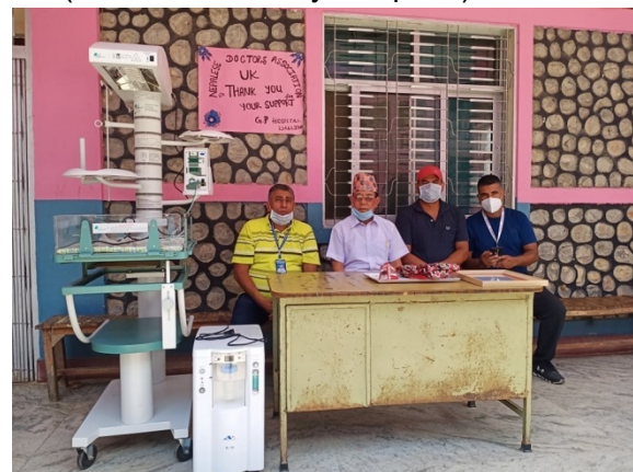
(Baby warmer and oxygen concentrator received by the team )