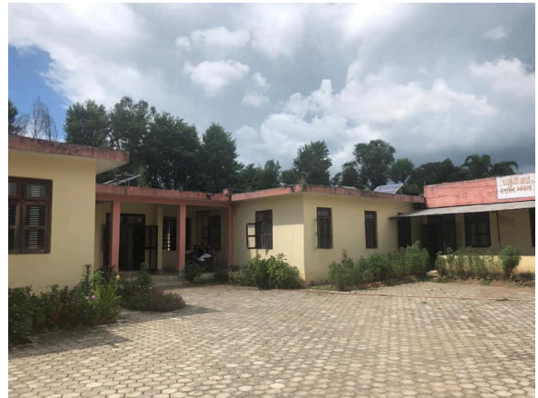
( Shreegao Health Post and people)