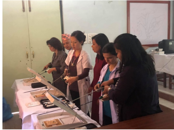
(Simulators and Candidates)