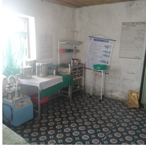
(Sinam Health Post)