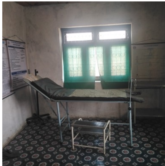
(List of equipments donated)